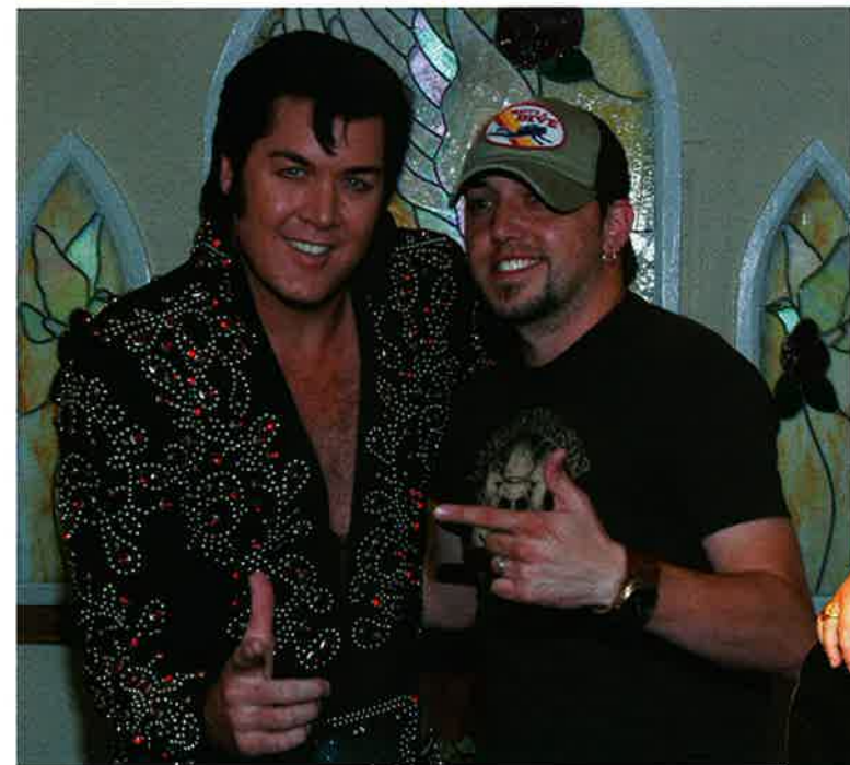
ELVIS PRESLEY & "JOHNNY CASH": BBR's Jason Aldean interviewed with CNN at the Graceland Wedding Chapel. Aldean's new single "Johnny Cash" references a Vegas wedding "by a preacher man who looks like Elvis."