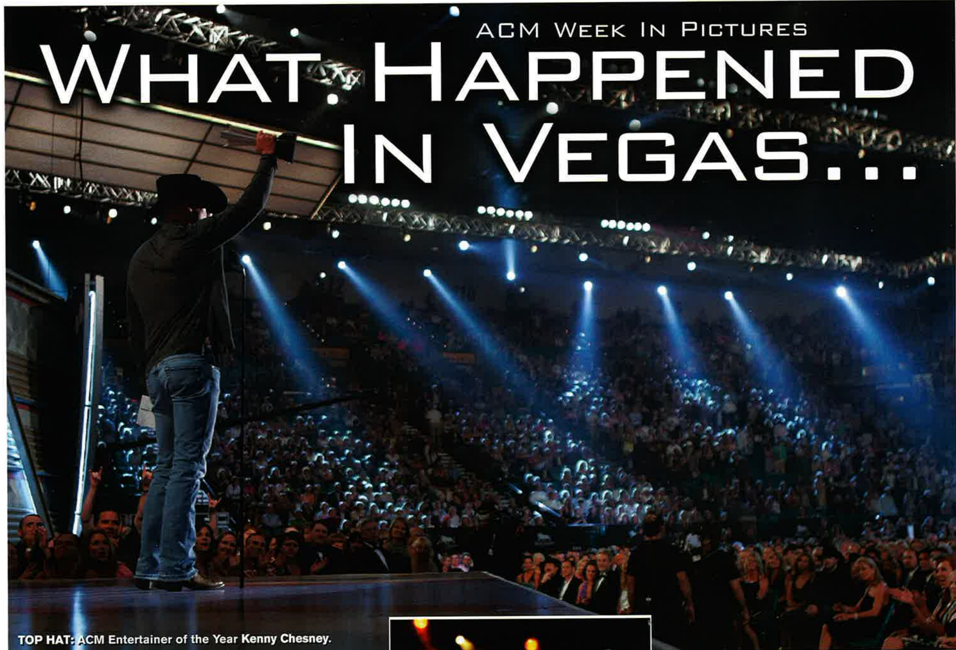
TOP HAT: ACM Entertainer of the Year Kenny Chesney.

L ike nothing else on the planet, Las Vegas is an assault on the senses, as these two pages can attest. The Country Aircheck crew didn't cover every ACM-related event of the week, but we came dangerously close. Here are some pictures to prove it. Well, the ones we can show you anyway.