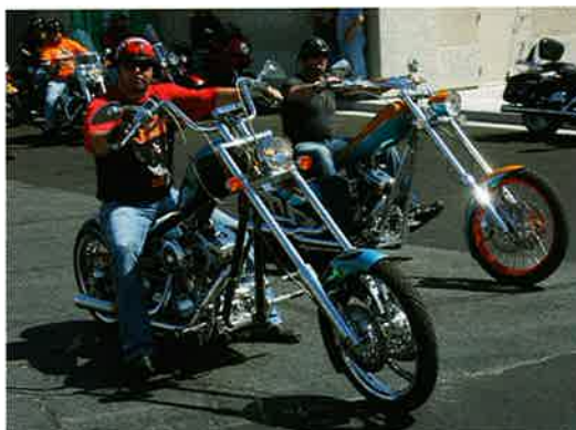
PEDAL FASTER: Montgomery Gentry's Eddie Montgomery (l) and Troy Gentry again led the pack of riders at the ACM's 4th Annual Charity Motorcycle Ride on ACM Sunday.