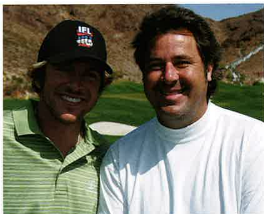
PUTT SHOT: Rascal Flatts' Joe Don Rooney (l) and MCA's Vince Gill played in the ACM Charity Golf Tournament in Boulder City on Monday.

"Someday maybe, but I don't want to mess with chemistry too much. I have one of the best record guys in the world, Joe Galante." — KENNY CHESNEY when asked backstage about starting his own record label