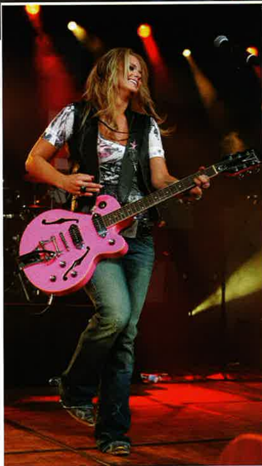
CAUSE WE CAN: Eventual New Artist winners Miranda Lambert and Rodney Atkins performed at the New Artist Party For A Cause Monday night in Las Vegas.